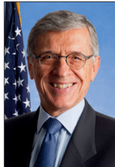
FCC Chairman Tom Wheeler

The 28th Annual Chairman's Dinner will be held Thursday, December 4 at the Washington Hilton, 1919 Connecticut Avenue, NW. The evening will begin with a reception at 6:00 p.m., followed by dinner at 7:30 p.m. in the International Ballroom and will be followed by remarks from FCC Chairman Tom Wheeler. Sponsor's tables include a $350.00 tax deductible donation to the FCBA Foundation.